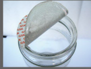
Glass Bottle Seals