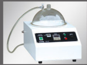
Leak Detection System