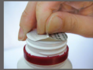
Hidden Pulling Tab